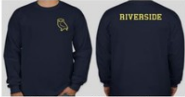
RIV03 - Navy Owl Tee, Long Sleeve Gildan Ultra Cotton 6 oz.