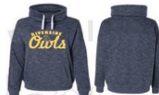
RIV09 - Navy Ladies RO Sweatshirt, Cowl 60 Cotton/40 Poly Fleece, Pouch Pocket

SHOW YOUR RIVERSIDE PRIDE! SPIRIT WEAR IS IDEAL FOR BIRTHDAY & HOLIDAY GIFTS!