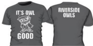
RIV08 - Gray Owl Good Tee, Short Sleeve