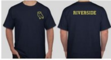
RIV01 - Navy Owl Tee, Short Sleeve Gildan Heavy Cotton 5.3 oz.

★★ SPIRIT WEAR CAN BE WORN ANY DAY OF THE WEEK WITH UNIFORM BOTTOMS! ★★