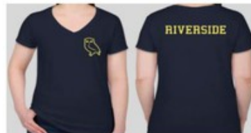
RIV07 - Navy Owl Ladies V-Neck Tee Gildan Ladies' Heavy Cotton 5.3 oz.