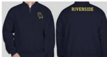
RIV05 - Navy Owl Sweatshirt, 1/4 Zip Jerzees 50/50, Cadet Collar