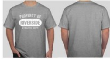
RIV02 - Gray Athletic Tee, Short Sleeve Gildan Heavy Cotton 5.3 oz.