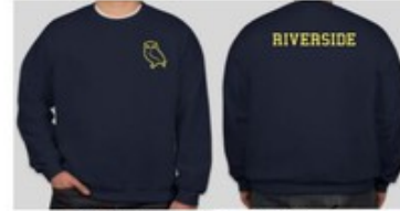
RIV04 - Navy Owl Sweatshirt, Crew Gildan Heavy 50/50 Blend 8 oz. Fleece